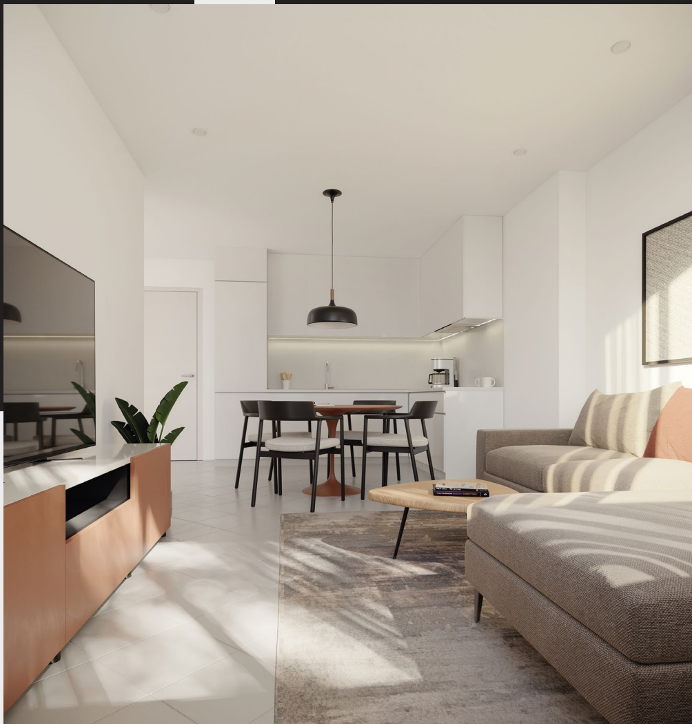
Living room - Kitchen